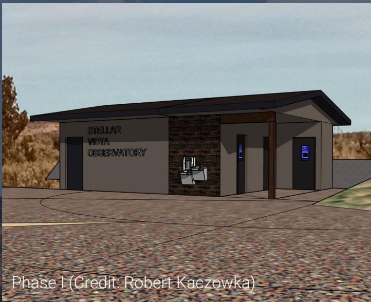
Phase I