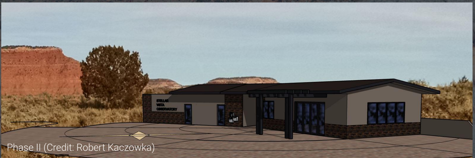
Phase II